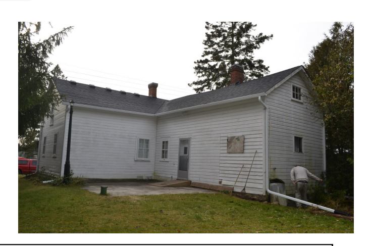
"A man should never neglect his family for business"