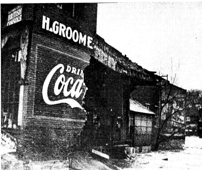
1936 Flood—North from Walton St. Bridge. Destruction of stores.

The pictures below are from the flood of 1936.