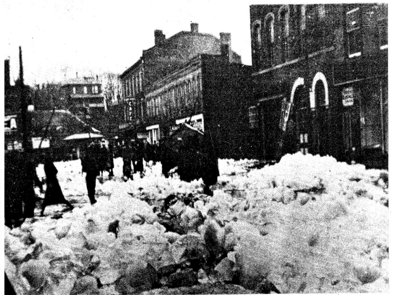
1936 Flood from Cancilla store Firehall.