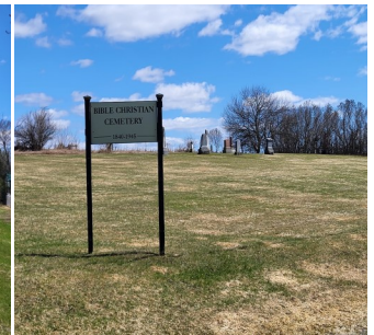
Bible Christian Cemetery 1840-1945

“Don't be pushed around by the fears in your mind. Be led by the dreams in your heart.” (Roy T. Bennett)