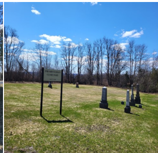
Presbyterian Cemetery 1837-1948