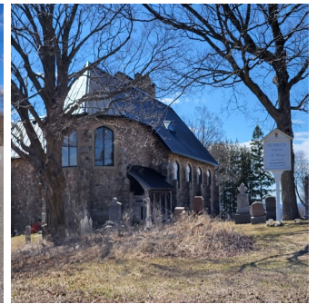
St. Paul's Anglican Church

In the 1800's Perrytown and area boasted a population of one hundred and fifty residents.